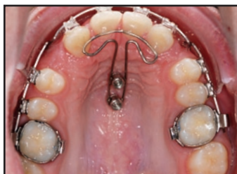
494 Miniplate System

This month's cover features a 3D volume rendering of a CT scan using software from Anatomage, Inc., as described in The Cutting Edge.