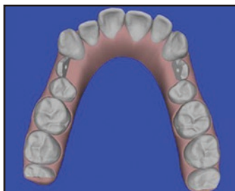
502 Invisalign Classification